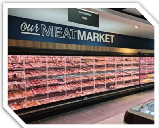
Premium Airshield Doors